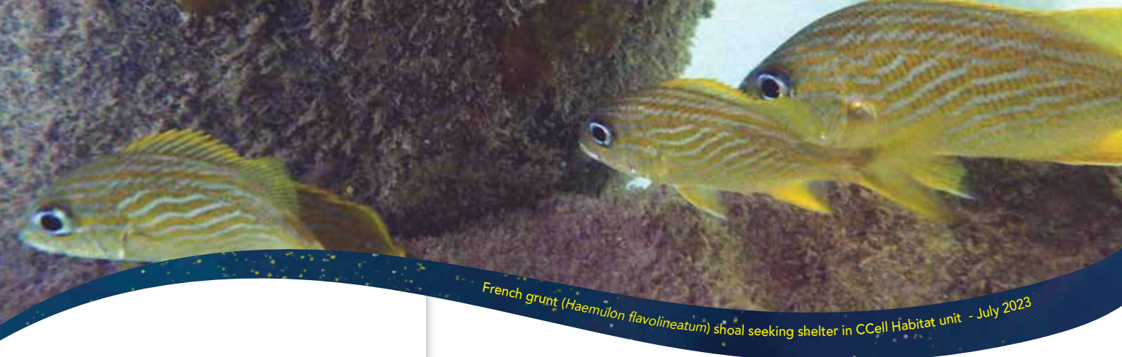
French grunt ( Haemulon flavolineatum ) shoal seeking shelter in CCell Habitat unit - July 2023