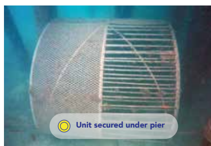
Unit secured under pier

In response to growing concerns about the beach condition and reduced marine life, the Royal Cancun Hotel partnered with CCell to test the installation of a CCell reef unit. This project focused on enhancing rock growth and biocolonisation, while evaluating the marine life within the surrounding waters.